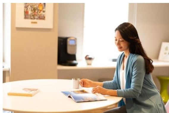
Lounge exclusive to Ladies' Floor